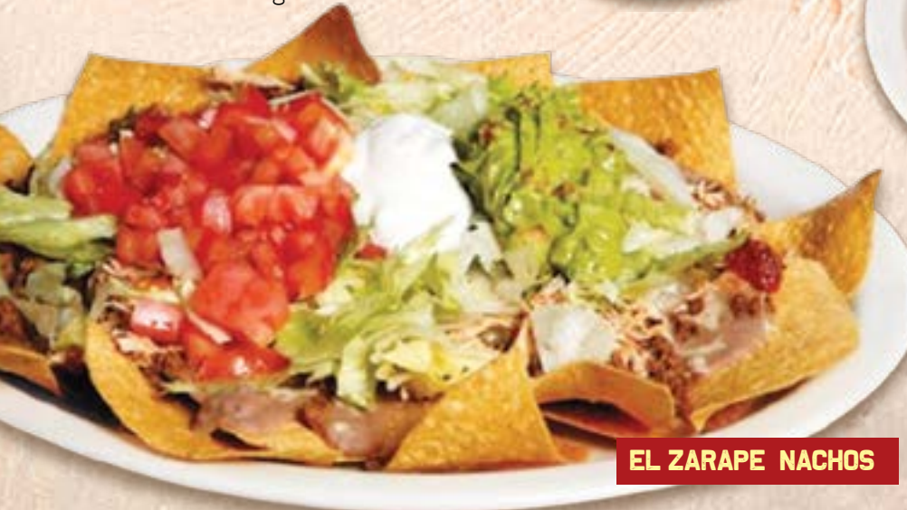
EL ZARAPE NACHOS