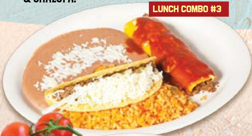
LUNCH COMBO #3

Taco, enchilada and choice of rice or beans.