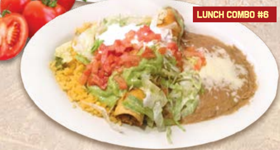
LUNCH COMBO #6