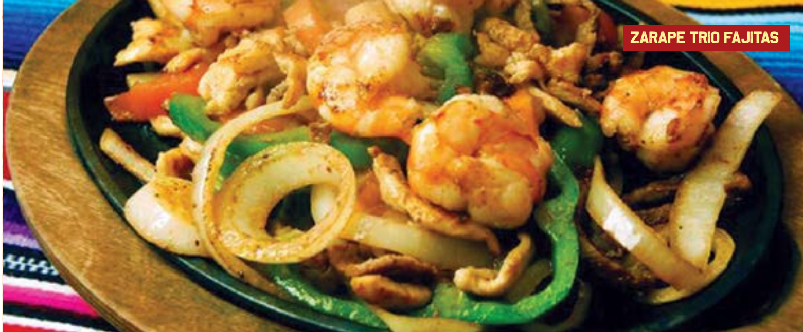
ZARAPE TRIO FAJITAS